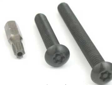
T-27 Driver 1/4 20 x2'' Pin-in-Head Security Screw 1/4 20 x3'' Pin-in-Head Security Screw

8901 Kelso Drive Baltimore, MD 21221 Office: 410-918-1200 Fax: 410-918-0964