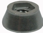
#1501 Edelen Security Lock Nut