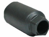
#3 Security Socket